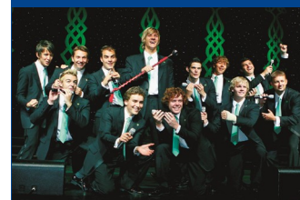
DUBLIN'S IRISH TENORS with special guests THE CELTIC LADIES