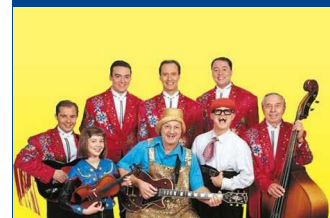
PRESLEYS' COUNTRY JUBILEE SHOW