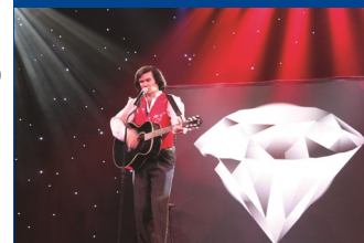
A NEIL DIAMOND TRIBUTE SHOW